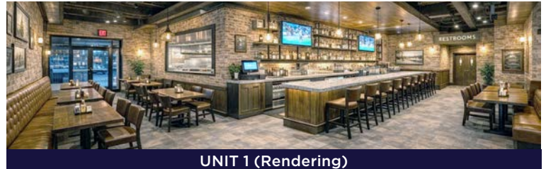
UNIT 1 (Rendering)